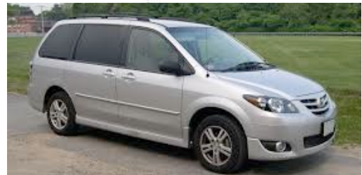
We travel the country in mini vans!